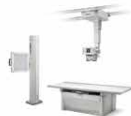
DigiEye 760 Pro Digital Radiography System