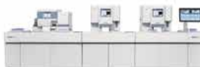
CAL 8000 Cellular Analysis Line