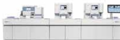
CAL 8000 Cellular Analysis Line