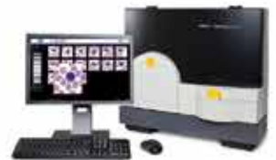
EasyCell ® assistant